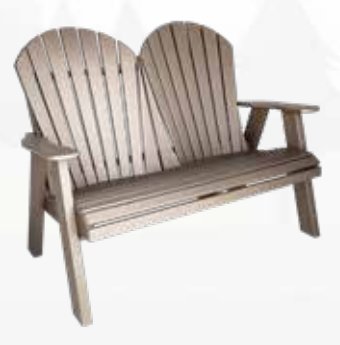
Fan Back Love Seat 53" wide x 30" deep x 40" high Seat: 46" wide x 19" deep