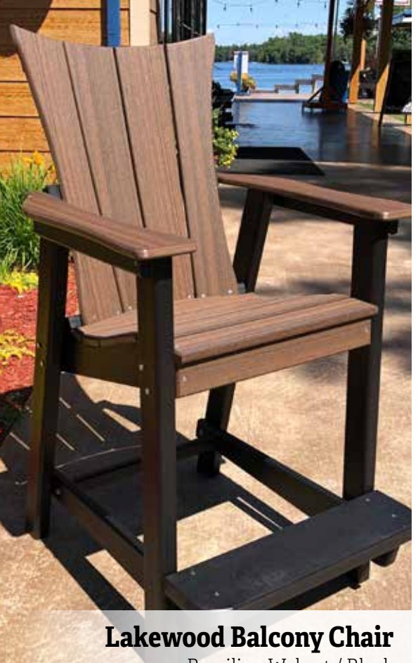
Brazilian Walnut / Black