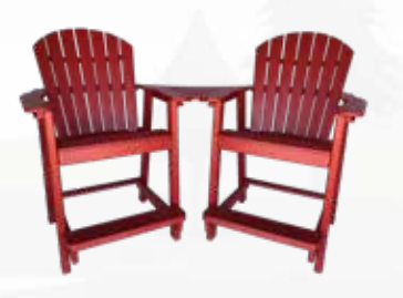
Deluxe Balcony Settee 71" wide x 28" deep x 46" high Seat: 22" wide