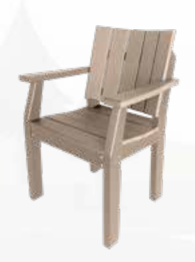
Minnetonka Dining Chair 24" wide x 19" deep x 33" high Available with or w/o arms