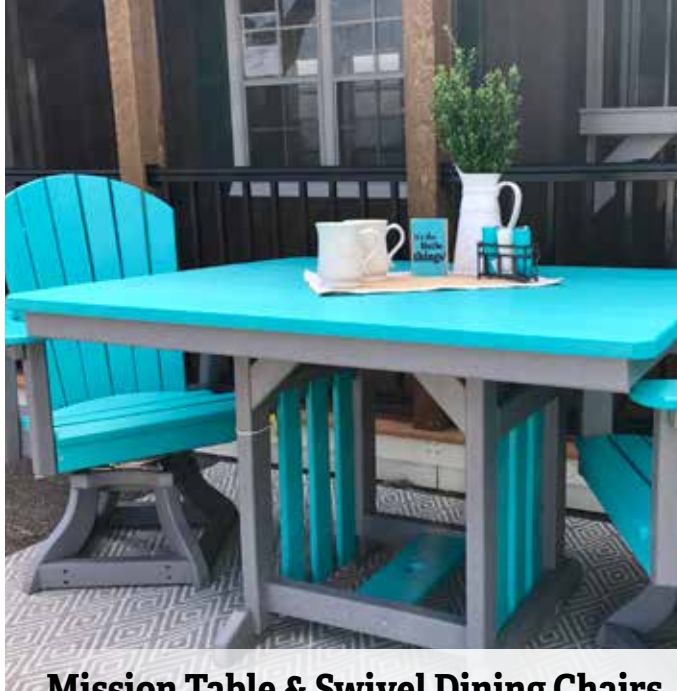
Mission Table & Swivel Dining Chairs Teal / Gray