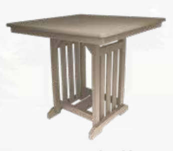
Square Pub Table 42" x 42" x 38" High