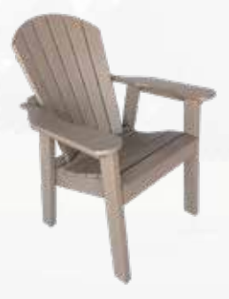
Deck/Dining Chair 28" wide x 25" deep x 36" high Seat: 19" wide