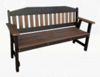
Park Bench 4' Bench: 51" wide x 19" deep x 36" high 5' Bench: 63" wide x 19" deep x 36" high