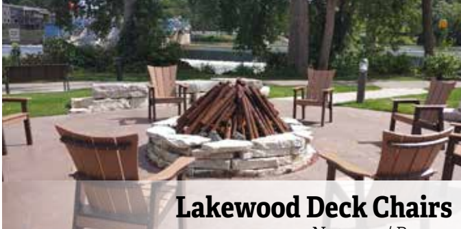
Nutmeg / Brown