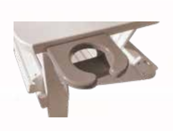
Cup Holder Fits most chairs