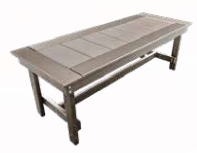
Coffee Table 46'' wide x 18'' deep x 16'' high