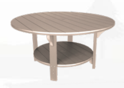
Patio Table Available in 36", 42", & 60" dia 30" high