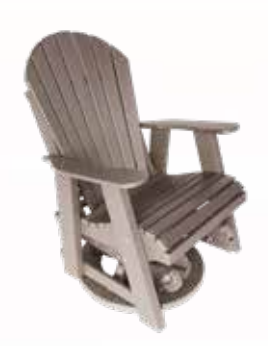
Fan Back Swivel Glider 29" wide x 32" deep x 42" high Seat: 22" wide x 19" deep