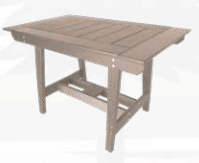
Minnetonka Table Available in 4′, 5′ & 6′ long, 36″ wide x 30″ high