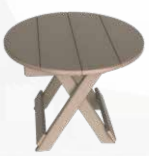
Round Folding Side Table 22" diameter x 17" high