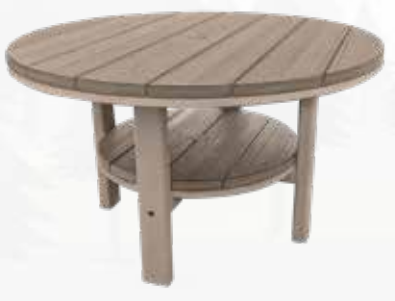
Conversation Table 36" diameter x 20" high