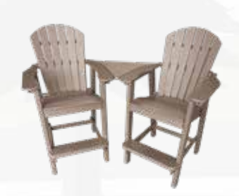
Balcony Chair Settee 66" wide x 28" deep x 47" high Seat: 19" wide