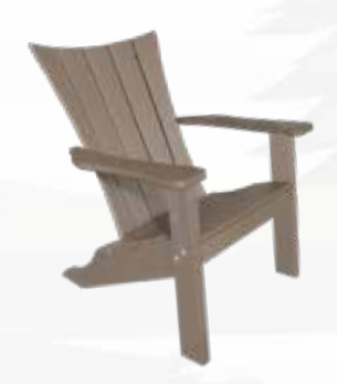
Lakewood Adirondack 31" wide x 39" deep x 38" high Seat: 32" wide x 19" deep