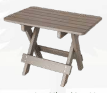
Rectangle Folding Side Table 16" wide x 24" deep x 17" high