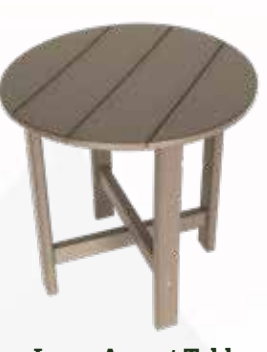
Large Accent Table 21" diameter x 21" high