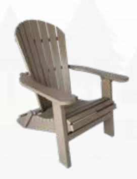
Deluxe Adirondack Chair 32" wide x 35" deep x 39.5" high Seat: 22" wide x 21" deep