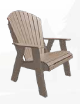
Fan Back Chair Deluxe 34.5" wide x 40.5" high Seat: 27" wide