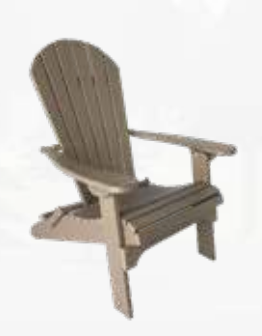
Regular Adirondack Chair 30" wide x 35" deep x 37" high Seat: 22" wide x 18" deep

All the Adirondacks, except for the Lakewood Adirondacks, are easily folded and stackable to make storage a breeze?