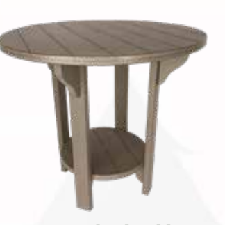
Round Pub Table Available in 36", 42", and 60" diameter