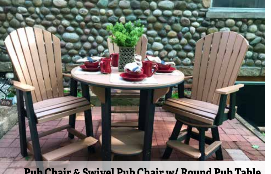
Pub Chair & Swivel Pub Chair w/ Round Pub Table Weatherwood / Black