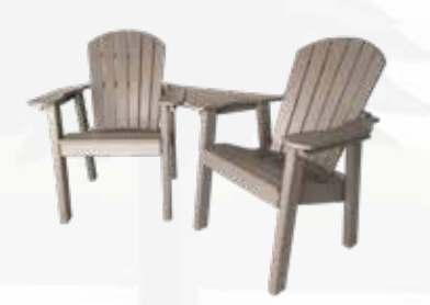
Deck Chair Settee 66" wide x 28" deep x 37" high Seat: 19" wide