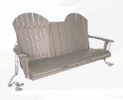
Fan Back Swing Available in 4' & 5'