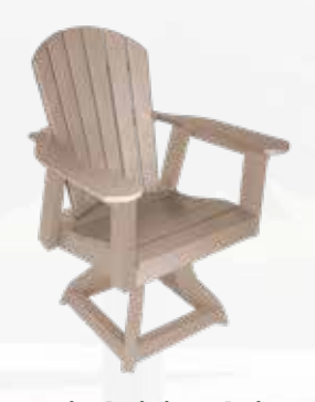
Swivel Dining Chair 28" wide x 25" deep x 38" high Seat: 19" wide

These dining products and accessories are sure to add class and comfort to your outdoor eating and entertaining. With a variety of styles available and our wide range of color options, you can craft a dining setup for your patio that will be uniquely you.