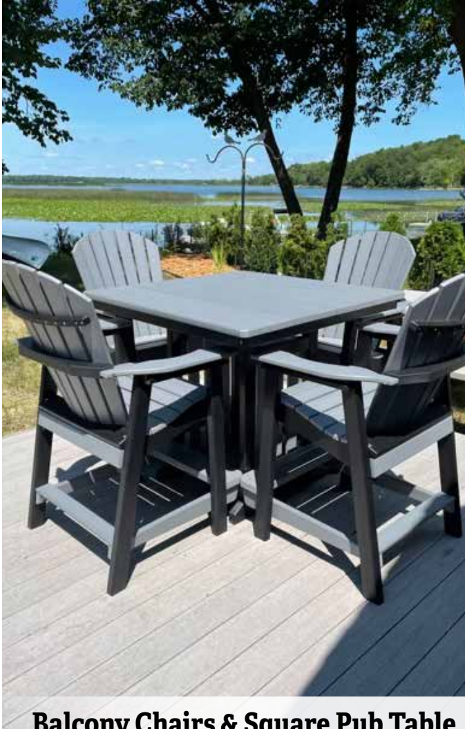
Balcony Chairs & Square Pub Table Gray / Black