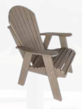
Fan Back Chair 29" wide x 29" deep x 40" high Seat: 22" wide x 19" deep

The Fan Back Chairs and Benches offer a relaxed seating position that is not as low as the Adirondack Collection, making it easier to get in and out. This collection offers both comfort and practicality.