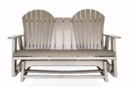
Fan Back Double Glider Available in 4' & 5' (5' shown) Seat: 19" deep x 40" high